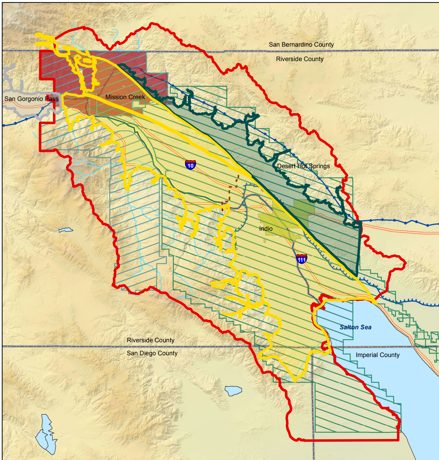
Figure 1-1: CASGEM Map - Coachella Valley